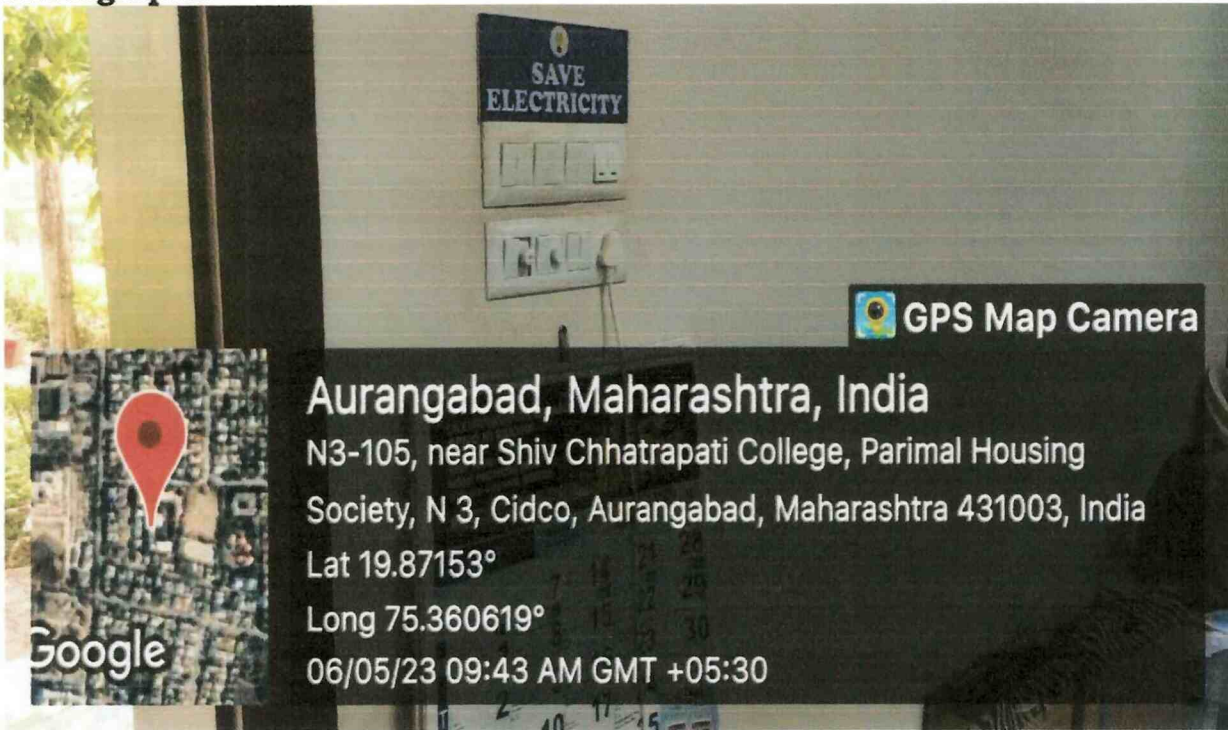
Glimpses of save electricity awareness