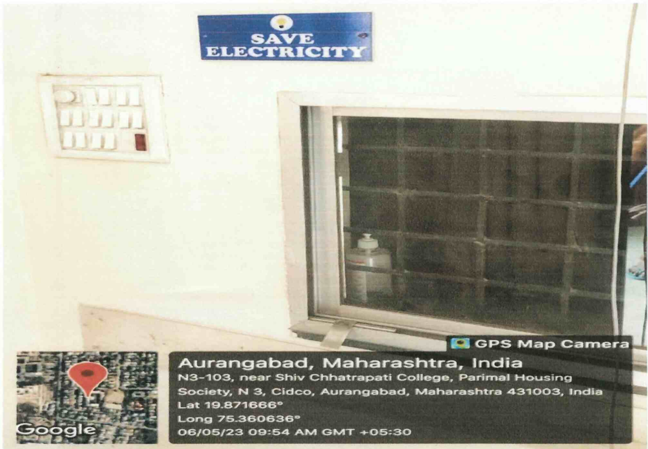
Glimpses of save electricity awareness