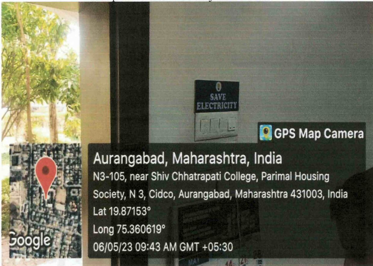
Glimpses of save electricity awareness